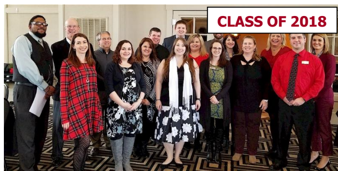
CLASS OF 2018