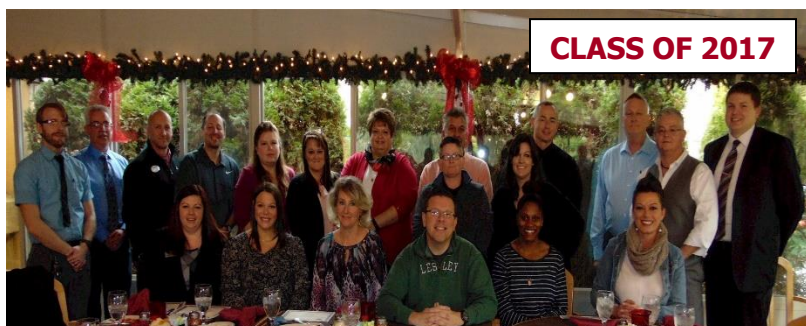
CLASS OF 2017