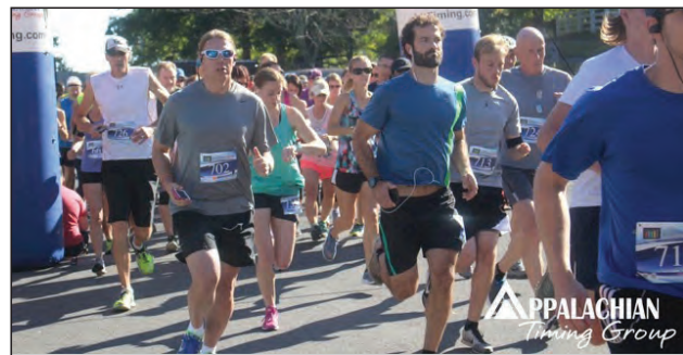
Beckley Rocket Run