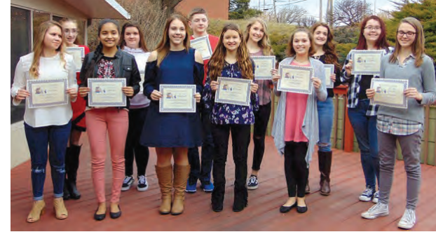
Student Recognition at Awards Reception