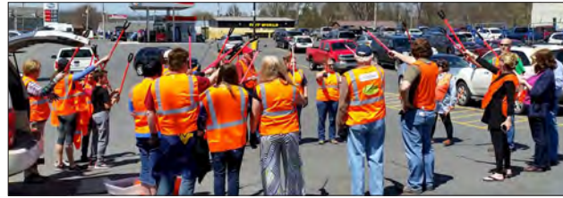
Litter Sweep on Harper Road