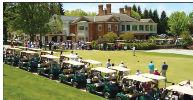
Bunker's Open Golf Tournament