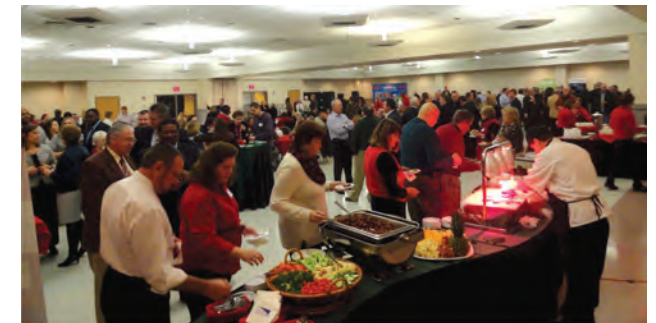
Holiday Celebration with Chamber Members

Business Contacts and Networking - Members say that opportunities for business networking is one of the main reasons they invest in the Chamber: